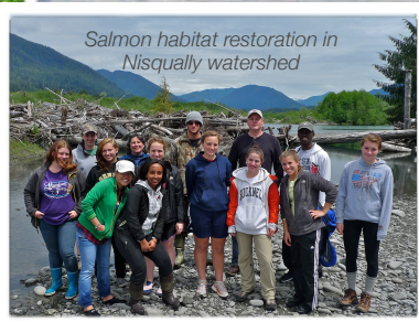
Salmon habitat restoration in Nisqually watershed