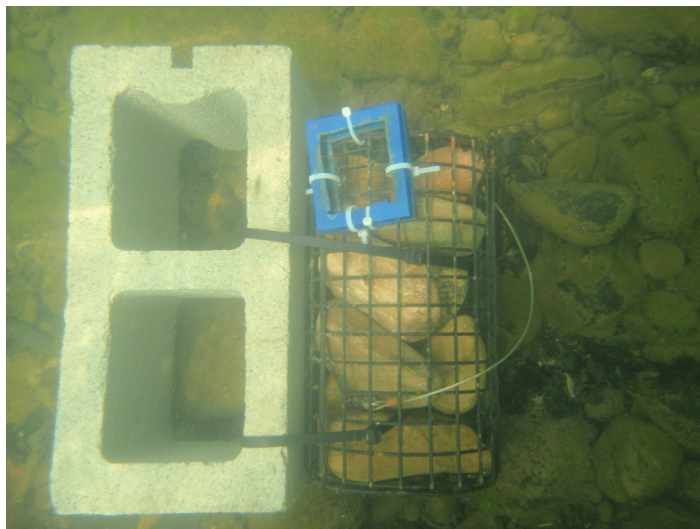
Figure 2. Rock basket sampler in the West Branch Susquehanna River. Benthic macroinvertebrates colonize rocks in the samplers over 6 weeks and can provide a standardized method for comparing communities across sites.

Matt's project has yielded some fascinating information about variability in benthic communities within and among riffles. Matt found that patch dynamics, species sorting, and mass effects (e.g., from organisms drifting downstream) were important at structuring communities within riffles but that neutral processes help to explain patterns at broad spatial scales (e.g., between riffles). Processes linking riffle communities also seem to depend on dispersal ability of benthic macroinvertebrates and whether organisms are dispersing as flying adult insects or