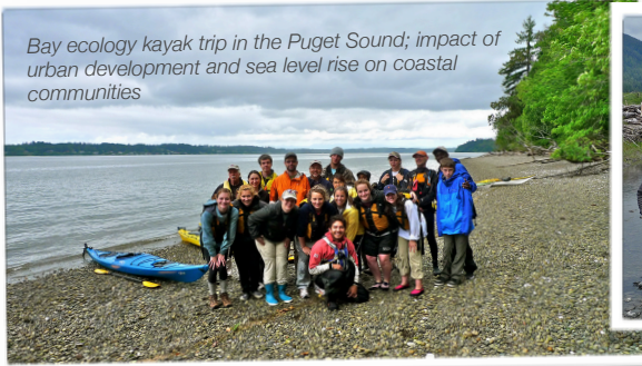
Bay ecology kayak trip in the Puget Sound; impact of urban development and sea level rise on coastal communities