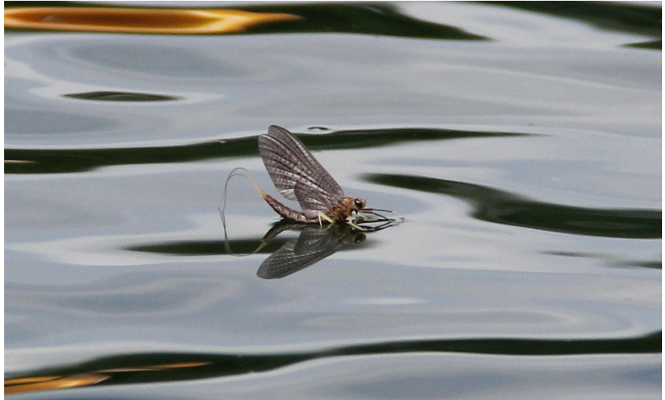
Figure 1. A freshly-hatched mayfly adult emerges onto the surface of the Susquehanna River and prepares to fly off in early May.

For the past three years, students from my research lab have been exploring various aspects of the benthic macroinvertebrate community in the Susquehanna River to answer basic questions about their diversity and abundance. We’ve sampled from dozens of locations and identified thousands of benthic macroinvertebrates from hundreds of different genera. The patterns