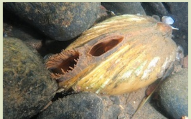
Mussel filter feeding on the bed of the West Branch Susquehanna River near Milton, PA.

Freshwater mussels (Unionidae) are one of the most endangered taxonomic groups in the United States. Approximately 12 species of mussels reside in the Susquehanna River. The eastern elliptio mussel ( Elliptio complanata ) was once the dominant species, but the population over the past fifty years has been declining and is suffering from a decline in young of the species, for reasons that have yet to be determined. One major factor may be the loss of the American eel from the upper Susquehanna River basin due to damming. E. complanata mussels are dependent on specific host fish to complete their life cycles. Since eel populations are a tiny fraction of what they were one hundred years ago, E. complanata have relied upon other benthic species of fish, such as the Tessellated Darter ( Etheostoma olmstedi ), to complete their life cycle. Bucknell river scientists are helping to assess how the reintroduction of eels to northcentral Pennsylvania may affect mussel populations in the river and its tributaries.