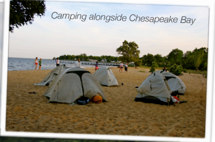
Camping alongside Chesapeake Bay