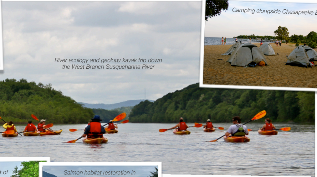
River ecology and geology kayak trip down the West Branch Susquehanna River