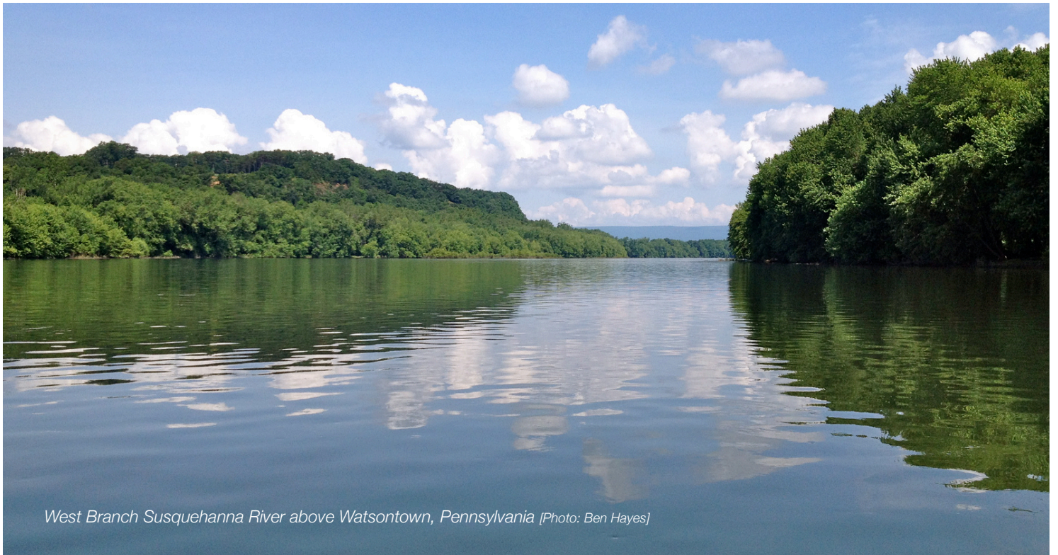
West Branch Susquehanna River above Watsonstown, Pennsylvania