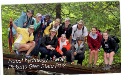
Forest hydrology hike at Ricketts Glen State Park

Watershed sustainability from the Susquehanna and Chesapeake Bay to the Olympic Peninsula and Puget Sound