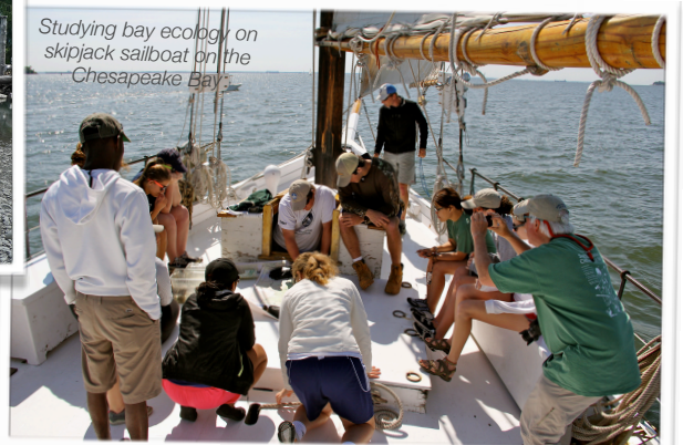
Studying bay ecology on skipjack sailboat on the Chesapeake Bay