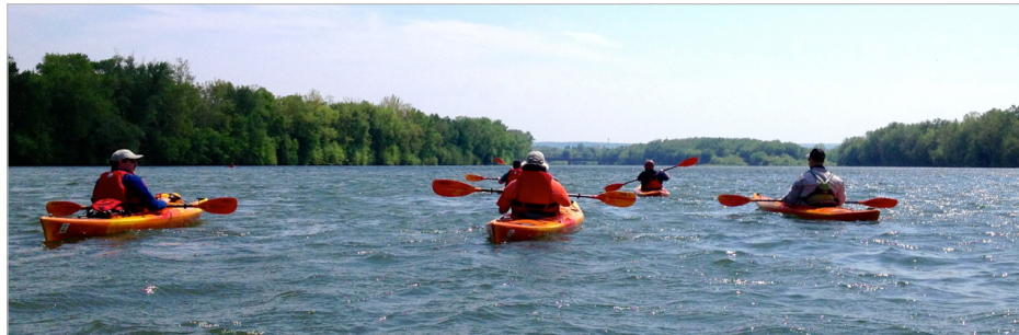
Discussing ongoing aquatic ecology and fluvial geomorphology studies as we float downstream.

At the same time, I wonder whether we really "see" the river in the absence of guided tours and cruises: many people, (myself included) usually have only a limited view of the river as we look over solid barriers on the bridges (most likely installed to prevent gawking at the river while driving). Combined with the need to monitor our driving at the same time, we are lucky to obtain a brief glimpse of the corpus of the river — the water. And, unless it is threateningly high (or low); the condition of the river seldom registers anything more than "yep, it's still there!"