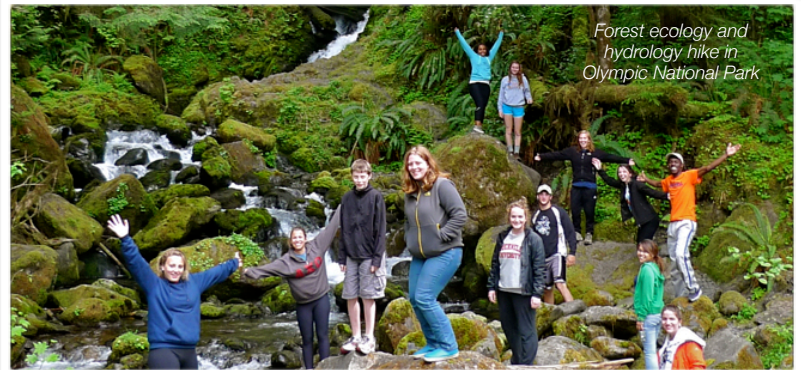
Forest ecology and hydrology hike in Olympic National Park