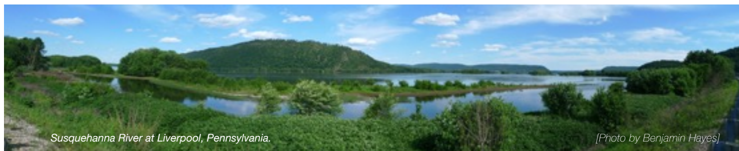
Susquehanna River at Liverpool, Pennsylvania.

Daily flow rates are reported in cubic feet per second (cfs). Data provided by the U.S. Geological Survey.