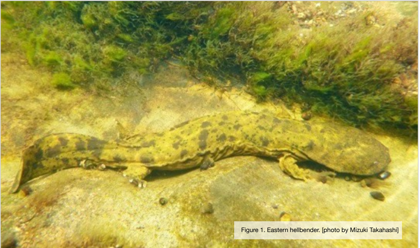
Figure 1. Eastern hellbender.