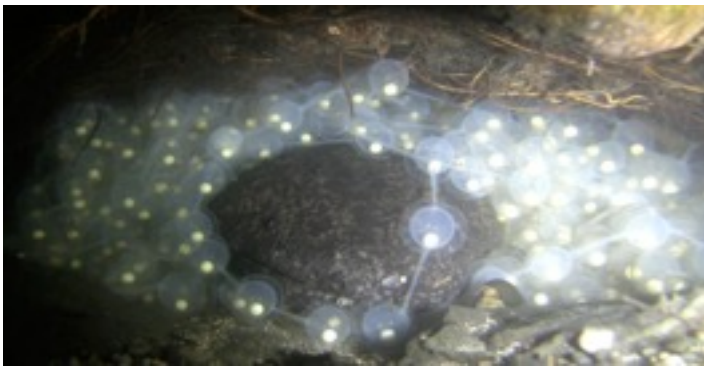
Figure 5. Male Japanese giant salamander caring for the eggs in his nest, Tottori, Japan.

My colleagues in Japan and I have studied reproductive ecology of Japanese giant salamander for the past years and provided the first quantitative analyses of male parental care behaviors in this family of salamanders (Fig. 5). Parental care by females is commonly observed among salamanders and is generally associated with terrestrial reproduction with internal fertilization. On the other hand, parental care provided by male salamanders is rare and associated with aquatic reproduction with external fertilization. We found that male Japanese giant salamanders exhibit a diverse array of care behaviors such as 1) tail fanning to provide oxygenated water for the eggs, 2) agitation of the eggs to prevent yolk adhesions and promote healthy embryo development, and 3) removal of unfertilized, dead, or water-mold infected eggs to prevent the infection from spreading over the entire clutch. Our lab is currently collaborating with Asa Zoo in Japan on the analyses of the nesting behaviors recorded by a video camera.