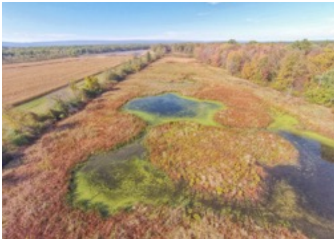
Montandon Marsh in Northumberland County. View is looking north (up river), with Central Builder's active gravel quarry visible in the distance.

All of these conservation and academic activities are made possible through the cooperation of the landowner, Central Builders, and their plant manager, Karl Bettleyon, who oversees mining operations at their Northumberland and Montandon facilities.