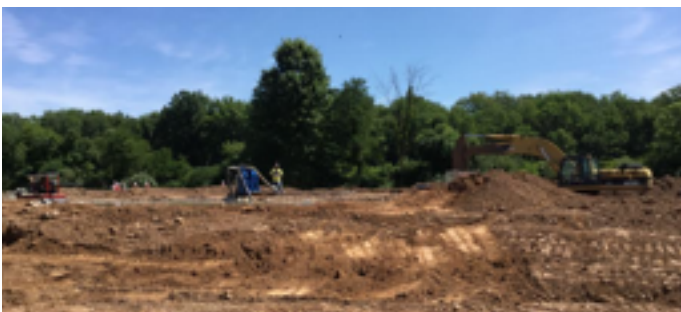
The new slurry wall being installed. Bentonite mixer visible on left and backhoe digging the trench on right.