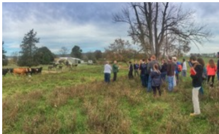
Rich Crago leads a group of Hydrology students on a tour of a Mennonite farm in Union County to look at how water runoff in fields and pastures concentrates into flow paths.