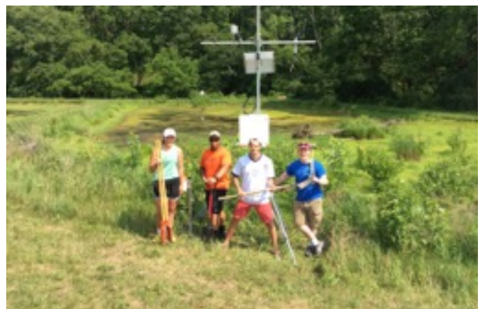
Summer student researchers joined together for a high-tech work party and installed a network of state-of-the-art weather station and water level instruments at the agricultural treatment wetlands at Ards Farm in Lewisburg, PA. This work is being done in cooperation with Ards Farm, the Union County Conservation District and the Buffalo Creek Watershed Association.