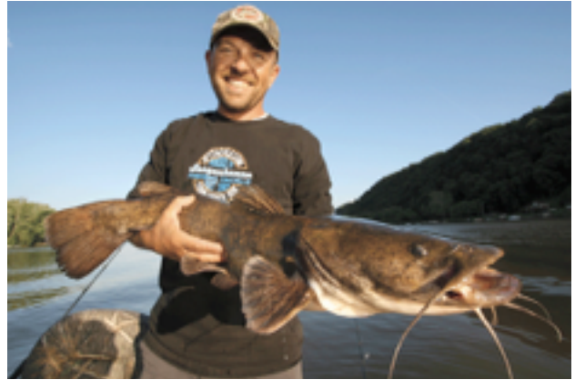
Flathead catfish, introduced in the lower Susquehanna River for sport fishing, are rapidly making their way north of Harrisburg, PA.