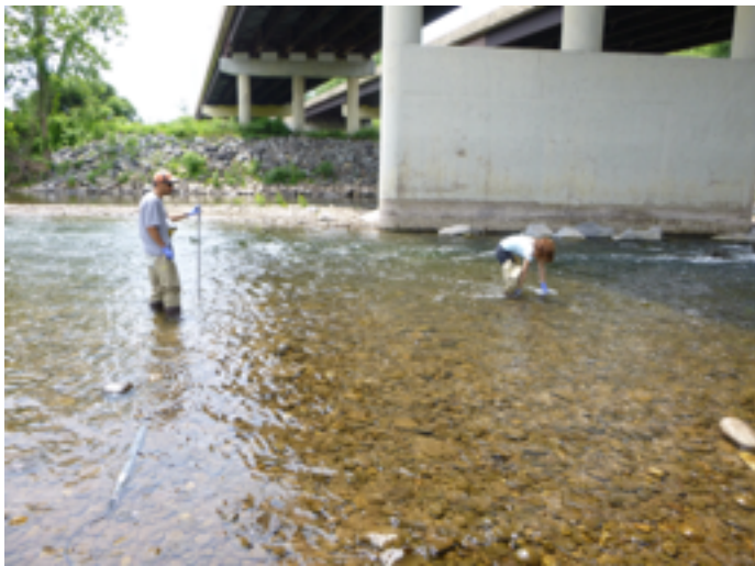
Figure 3. Water sampling in Pine Creek