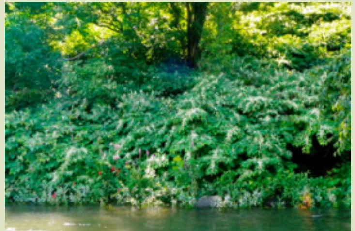
Japanese knotweed growing along the banks of the Susquehanna at Milton State Park.

Her findings show that plots in sites invaded by P. cuspidatum are significantly less species diverse than those in intact plots. Species recorded within both communities, such as the common blue violet ( Viola cucullata ), smooth Solomon's seal ( Polygonum biflorum ), and green dragon ( Arisaema dracontium ), had significantly reduced densities in the invaded plots compared to the intact plots.