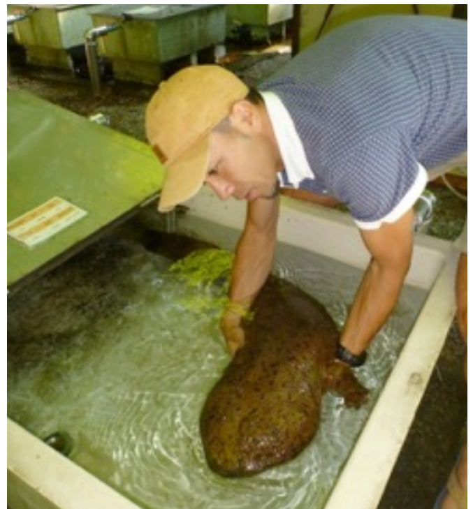
Figure 4. The author holding the largest Japanese giant salamander at Asa Zoo, Hiroshima, Japan.

I have also been involved in a few Japanese giant salamander projects, and spent the last fall in Japan during my leave. The Japanese giant salamander can grow up to 5 ft (Fig. 4) and is widely (though not commonly) distributed throughout the southwestern Japan. Since 1952 the species has been federally protected as a special natural monument designated by the Japanese Agency for Cultural Affairs; this designation is based on its cultural and educational significance. However, the Ministry of Environment, which accesses the conservation status of organisms in Japan, recently raised the status of the Japanese giant salamander from NT (Near Threatened) to VU (Vulnerable). Major conservation issues include damming, concrete banking, habitat destruction, water pollution, and hybridization with introduced Chinese giant salamander. Despite their declining status, the government shows no initiative in conserving this culturally, ecologically and academically important species. This situation is further exacerbated by a lack of researchers and funding. As a result, not only do we fully understand the population status of many sites throughout their distribution range, but we also lack the basic knowledge of its biology and ecology.