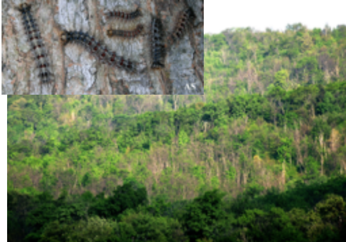
In 2015, gypsy moth caterpillars, which came from Europe and Asia in 1869, caused nearly 700,000 acres of defoliation to Pennsylvania forests.