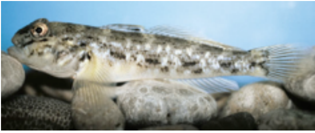
Round Gobies an invasive fish species, is increasingly a common sight in cold tributary streams in northwestern Pennsylvania.