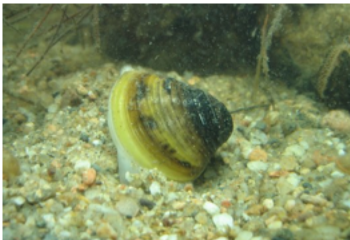
Asiatic Clam ( Corbicula fluminea ), an invasive mussel species, is now found throughout the Susquehanna River basin. It is thought to be introduced into Columbia River as a food item by Chinese immigrants. The impact of its presence on the aquatic ecosystem is uncertain.

The River Reporter cannot tackle all of these challenges, but we hope, in the next few issues, to provide some information on some of the water-related challenges important to the Susquehanna River, and to those who live in its “Sphere of Influence.”