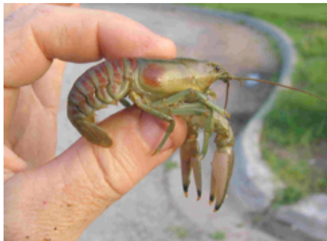
Rusty Crayfish ( Orconectes rusticus ), an invasive invertebrate species, is now found locally in the Susquehanna River. It is a very aggressive species, known to eat and out compete native crayfish species and even eats small fish. The impact of its presence on the aquatic ecosystem is uncertain.