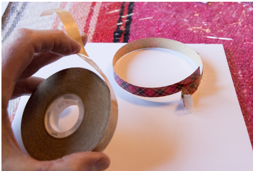
A roll of double-sided tape with outer plaid strip cut off.

Start by placing one photo corner on the corner of the photo and press it to the back of the pre-cut mat so that the photo is properly aligned when viewed from the front. The beauty of photo corners is that you can lift off the one corner if you find the photo needs adjustment. When photo is properly aligned, add the other three photo corners. Press down on the four corners for a secure mount.