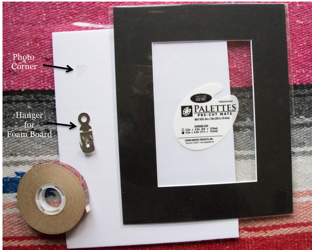
Roll of double-sided tape, hanger, and clear photo corner lying on white foam board next to a black pre-cut mat for a 5" by 7" photo.

Supplies Needed: 1/4 inch thick foam board, an appropriately sized pre-cut mat, double-sided tape, four photo corners, and a hanger for foam board back.