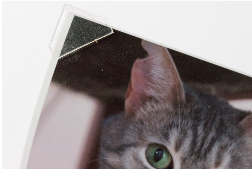
A clear plastic photo corner with sticky side towards the front.

time due to changes in temperature and humidity. It's best to mount the photo so it can shift a little. I like to use four photo corners to hold the photo. They come in many colors and decorations. I like to use clear ones. It doesn't matter what color you use since they will be hidden from view. Since the photo is not attached by glue or tape, you can easily remove it later if needed.