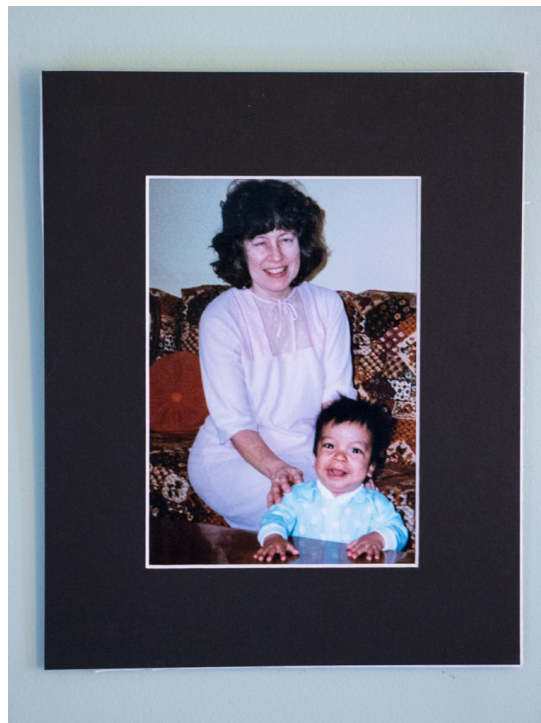
The finished matted photo hanging on a wall.

Alternative Hanger: If you have a small and lightweight artwork, you might consider the above plastic hanger (also available at Brushstrokes ) as an alternative to the metal one. It's cheaper but not as strong. As with the metal hanger, measure down 1/3 of artwork's height on both sides and place the plastic hanger in the center with the saw tooth opening up. Remove the protective paper before attaching the sticky side to the back of the artwork. This is also a good alternative if for some reason you did not use 1/4 inch foam board as a back.